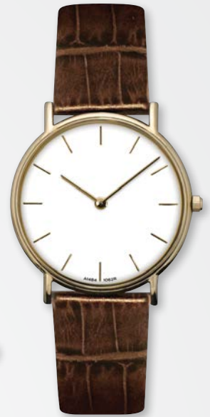
A1484-WHT/COG CALL FOR MSRP