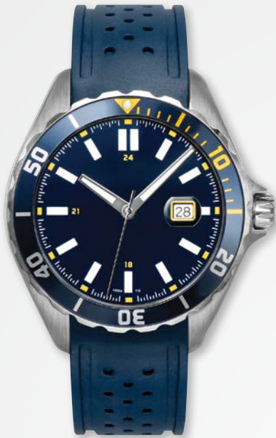
A9324W/RU-BLU/BLU MSRP: $315