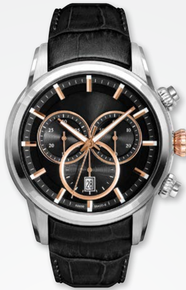
A9830TR/S-BLK MSRP: $525