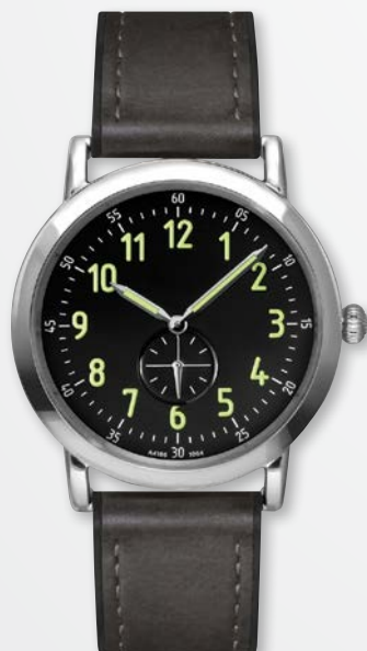
A4186W/NS-BLK MSRP: $270