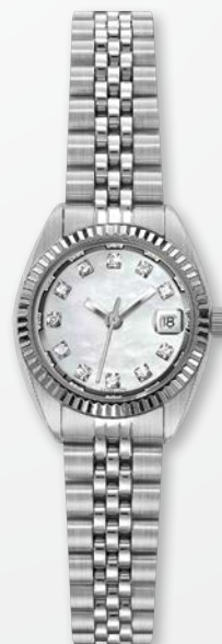
A4700W-LIT MSRP: $465