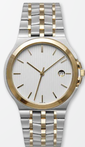
A4331T-WHT MSRP: $375