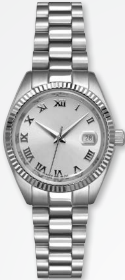
A4218W/B-SIL MSRP: $345