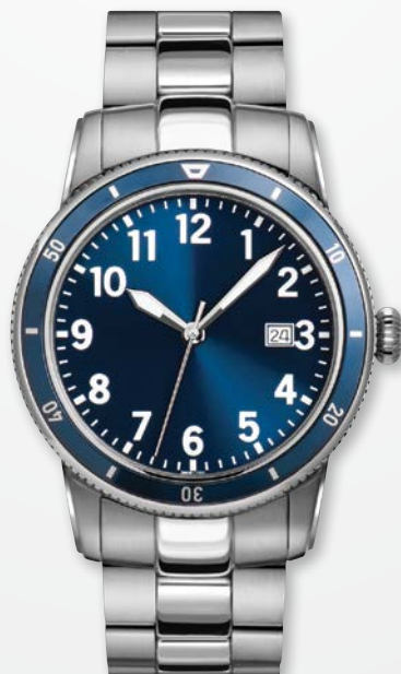
A8830W/B-BLU MSRP: $375

/TB: Stainless steel bracelet, Diver security lock buckle