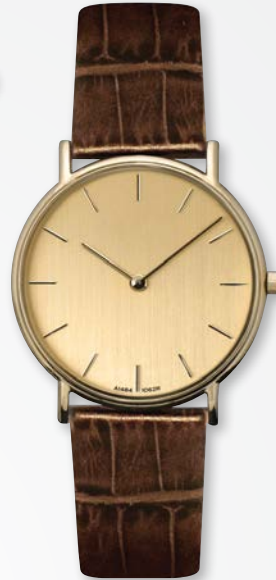
A1484-CHA/COG CALL FOR MSRP