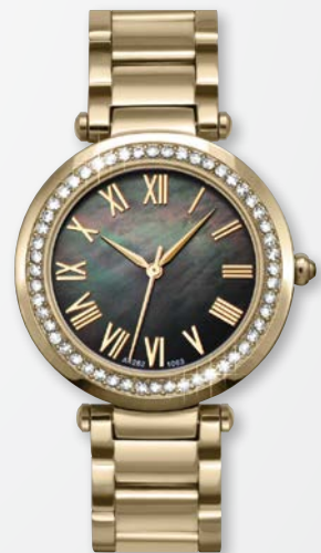
A4282Y-DRK MSRP: $345