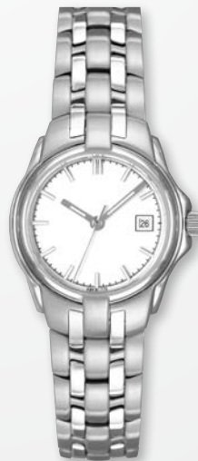
A9416W-WHT MSRP: $255