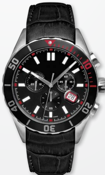
A9824W/S-BLK MSRP: $510