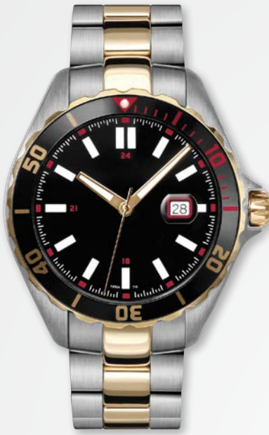
A9324T/B-BLK MSRP: $450