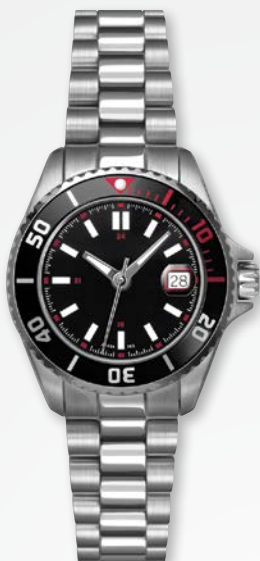
A9424W/B-BLK MSRP: $360