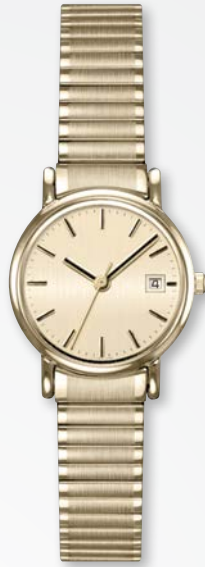
A4252Y/X-CHA MSRP: $270