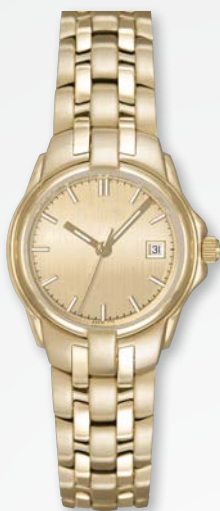
A9416Y-CHA MSRP: $360