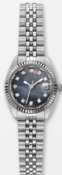
A4700W-DRK MSRP: $465