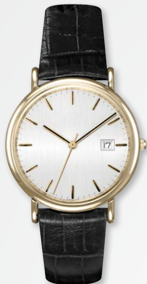
A4152Y/S-WHT MSRP: $240