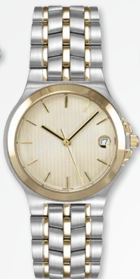
A4330T-CHA MSRP: $360