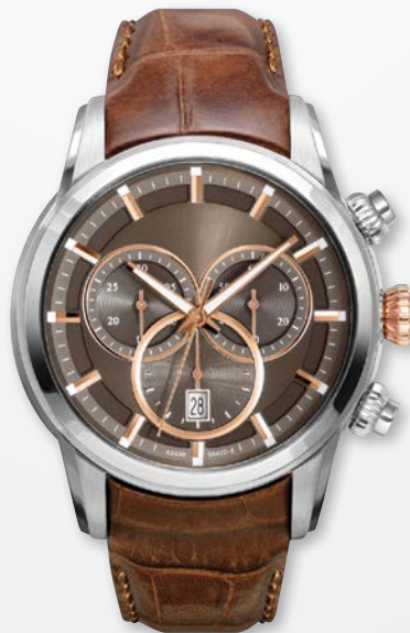
A9830TR/S-BRN MSRP: $525