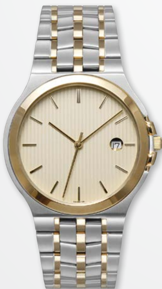
A4331T-CHA MSRP: $375