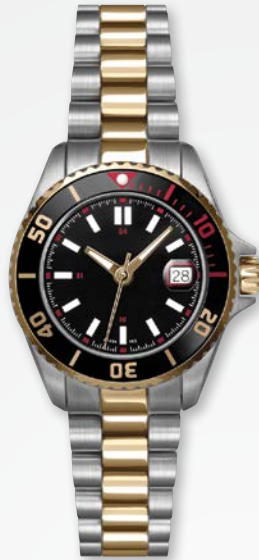
A9424T/B-BLK MSRP: $450