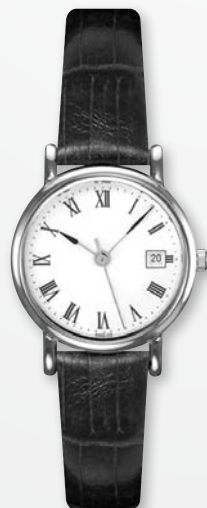
A4252W/S-ROM MSRP: $210