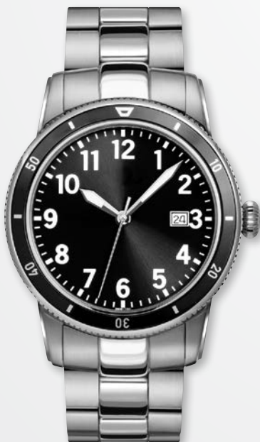
A8830W/B-BLK MSRP: $375