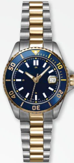
A9424T/B-BLU MSRP: $450