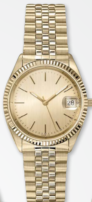
A4508Y-CHA MSRP: $420