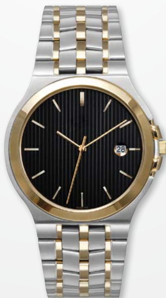
A4331T-BLK MSRP: $375