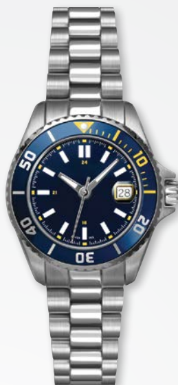
A9424W/B-BLU MSRP: $360