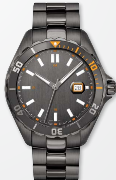
A9324GR/B-GRE MSRP: $450