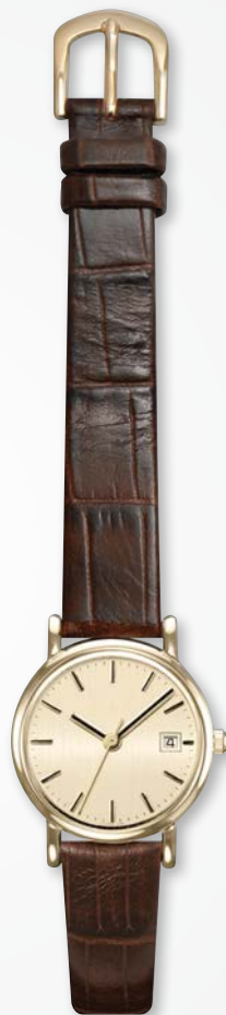
A4252Y/S-CHA MSRP: $240