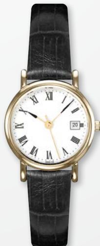
A4252Y/S-ROM MSRP: $240