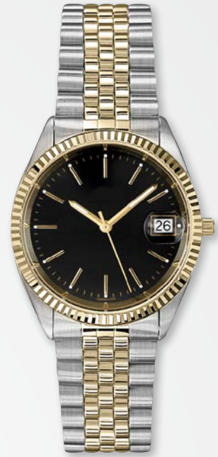
A4508T-BLK MSRP: $420