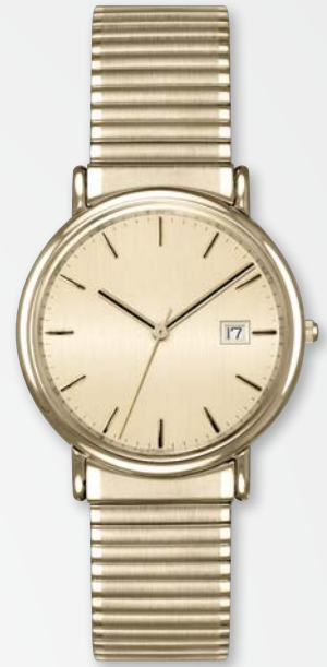
A4152Y/X-CHA MSRP: $270