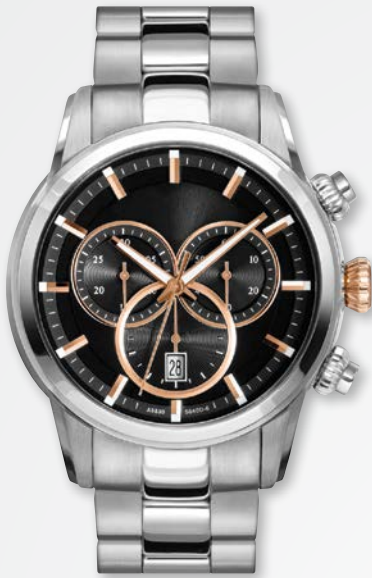
A9830TR/B-BLK MSRP: $510