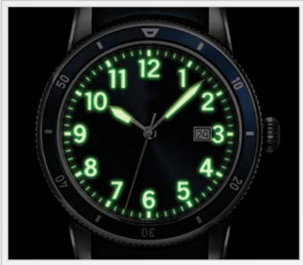
Swiss Super LumiNova highly luminous dial and hands on model A8830.