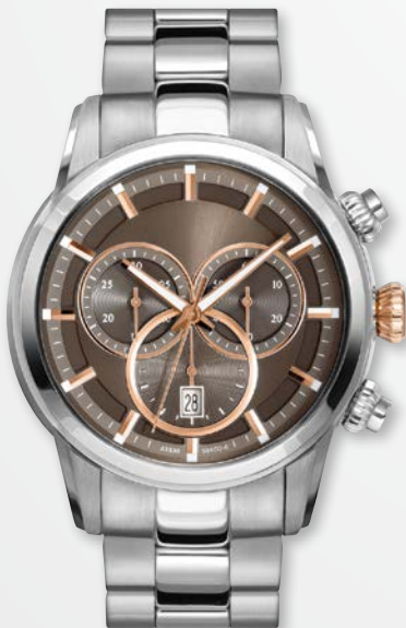
A9830TR/B-BRN MSRP: $510

/S: Genuine leather strap, Dual push-button release deployment buckle