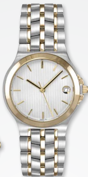
A4330T-WHT MSRP: $360