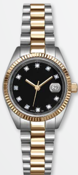
A4718T/B-BLK MSRP: $525

Ladies, 3 ATM, Stainless steel case, Stainless steel bracelet, Genuine sapphire crystal, Case diameter: 23 mm