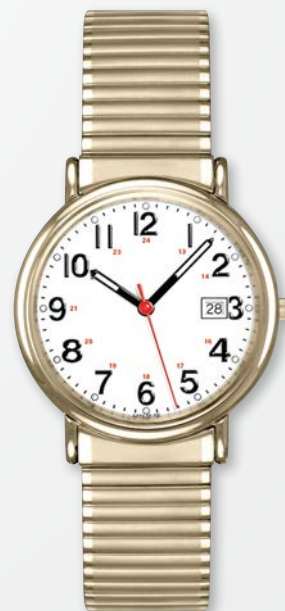
A4152Y/X-FF MSRP: $270