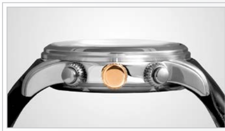
Domed genuine sapphire crystal on model A9830TR.