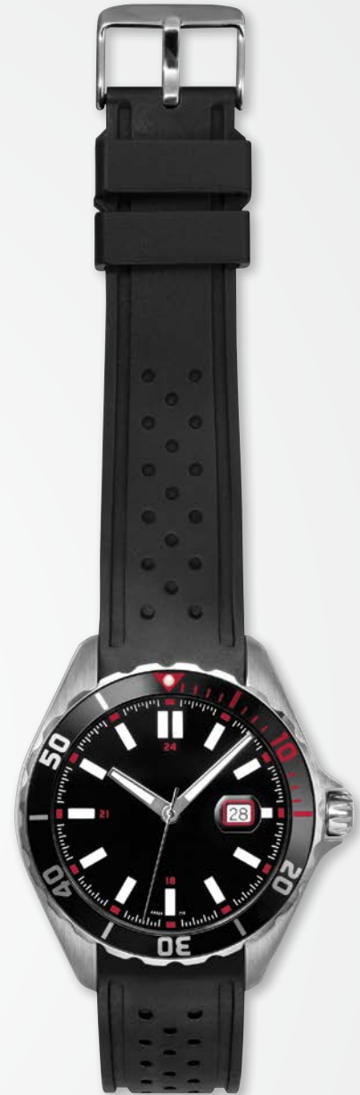
A9324W/RU-BLK/BLK MSRP: $315

Swiss Super LumiNova highly luminous dial and hands on models A9324 & A9424.