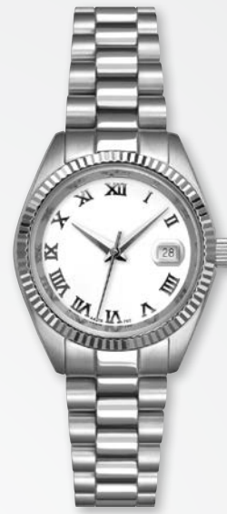
A4218W/B-WHT MSRP: $345