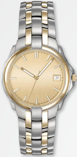
A9516T-CHA MSRP: $360