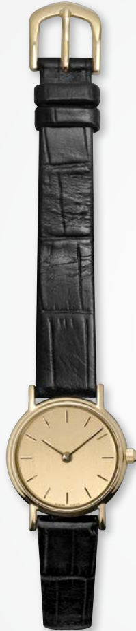
A1494-CHA/BLK CALL FOR MSRP