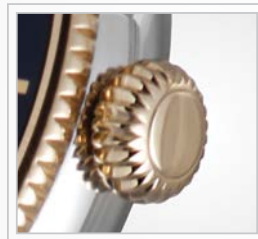
Antique shaped screw down crown on model A8830.