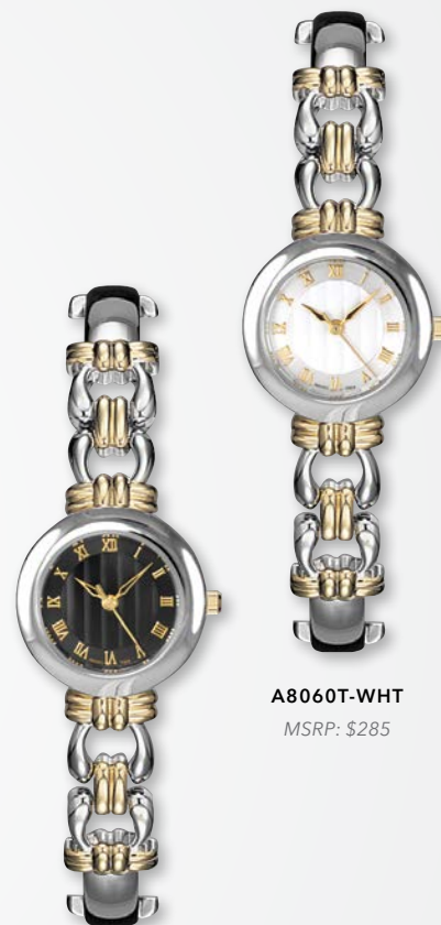
A8060T-WHT MSRP: $285

Ladies, 10 ATM, 11 genuine diamonds, Stainless steel case, Stainless steel bracelet, Diver security lock buckle, Screw down crown, Genuine sapphire crystal with lens, Genuine mother-of-pearl dial on LIT models, Case diameter: 29.8 mm