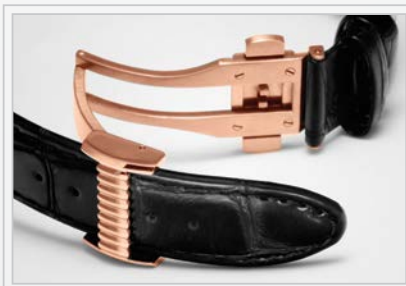
Dual push-button release deployment buckle on model A9830R/S.