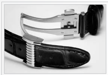
Dual push-button release deployment buckle on model A9830TR/S.