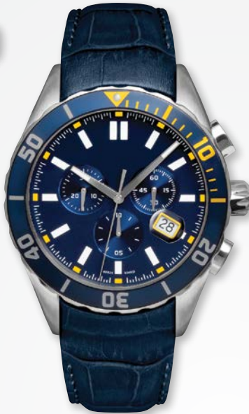
A9824W/S-BLU MSRP: $510