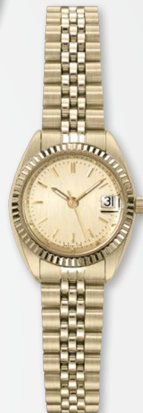
A4208Y-CHA MSRP: $420