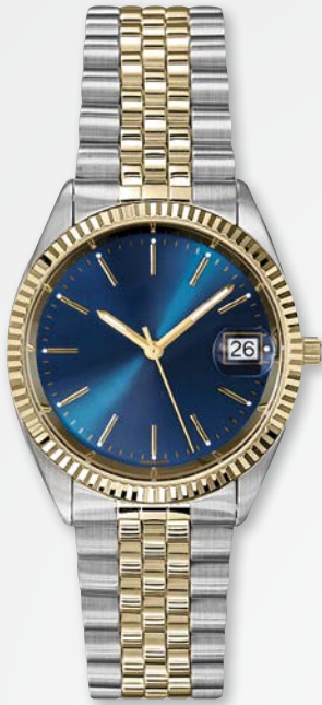
A4508T-BLU MSRP: $420