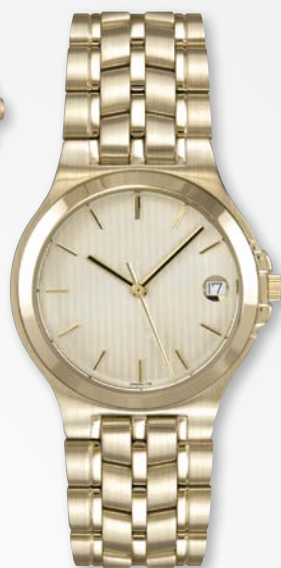
A4330Y-CHA MSRP: $360