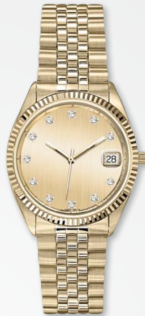
A4600-CHA MSRP: $510