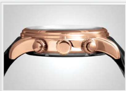
Domed genuine sapphire crystal on model A9830R.