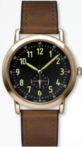
A4186Y/NS-BLK/BRN MSRP: $300