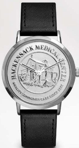
Die-Struck Medallion Dial