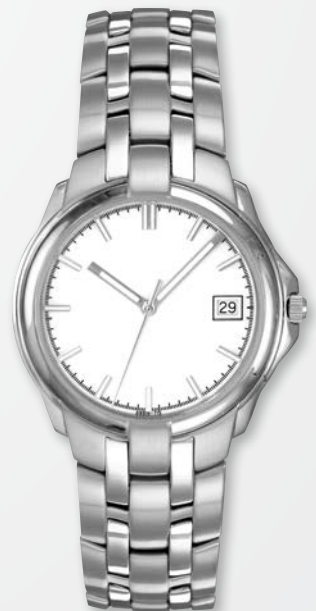
A9516W-WHT MSRP: $255