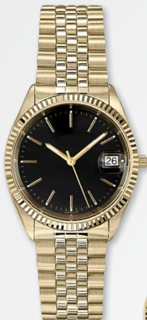
A4508Y-BLK MSRP: $420