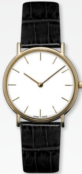
A1484-WHT/BLK CALL FOR MSRP