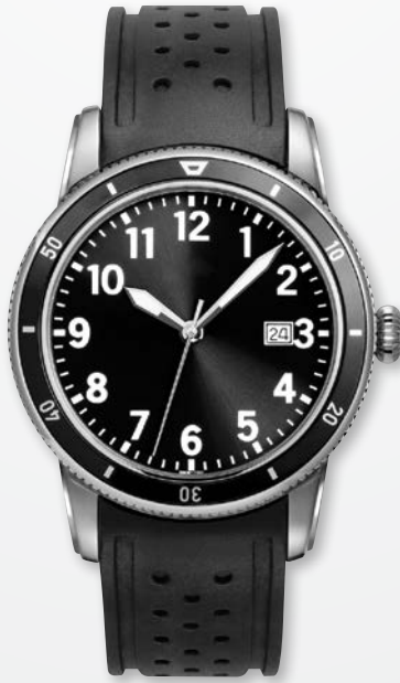
A8830W/RU-BLK MSRP: $330