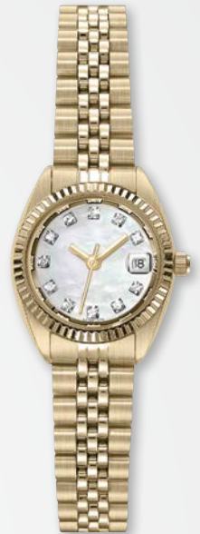
A4700-LIT MSRP: $540