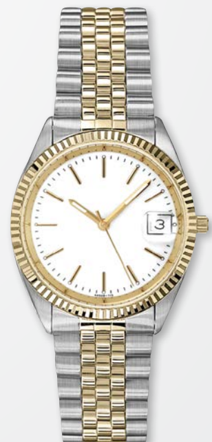
A4508T-WHT MSRP: $420