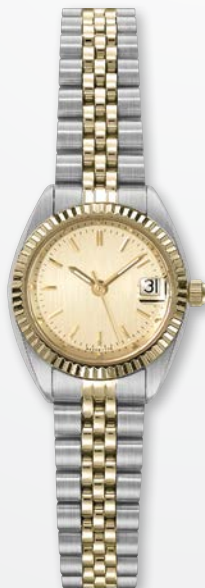
A4208T-CHA MSRP: $420