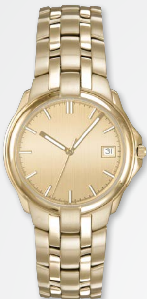
A9516Y-CHA MSRP: $360