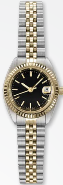
A4208T-BLK MSRP: $420