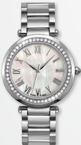
A4282W-WHT MSRP: $270

SWAROVSKI CRYSTAL ACCENTS MOTHER-OF-PEARL DIAL