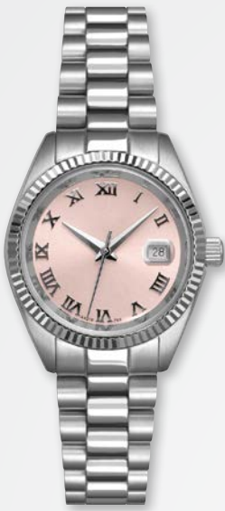
A4218W/B-PIN MSRP: $345