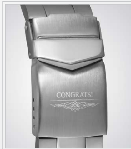
Engraving on buckle