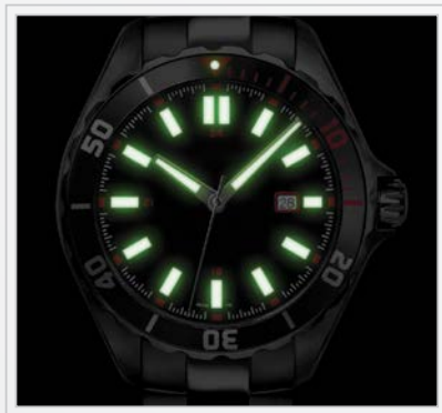
Swiss Super LumiNova highly luminous dial and hands on models A9324 & A9424.

Ladies, 10 ATM, Stainless steel case, Stainless steel bracelet, Diver security lock buckle, One-directional rotating diver bezel, Screw down diver crown, Luminous dial and hands, Genuine sapphire crystal with lens, Case diameter: 30 mm