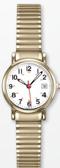
A4252Y/X-FF MSRP: $270