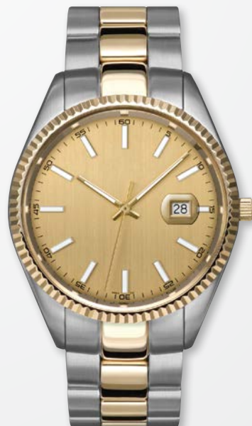
A4408T/B-CHA MSRP: $435

Swiss Super LumiNova highly luminous dial and hands on model A4408.