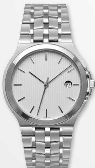
A4331W-WHT MSRP: $285

Gents, 10 ATM, Stainless steel case, Stainless steel bracelet, Diver security lock buckle, Genuine sapphire crystal, Case diameter: 41 mm