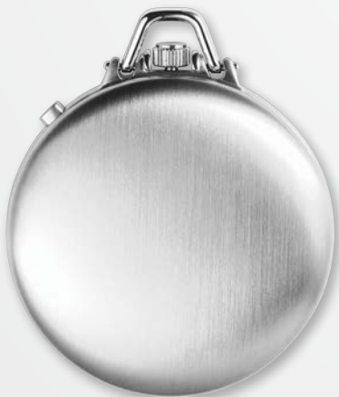
A1615W MSRP: $525

The ultimate 100% water-resistant Savonette Pocket Watch. These stainless steel classics are uniquely designed to resist both dust and water (5 ATM tested).