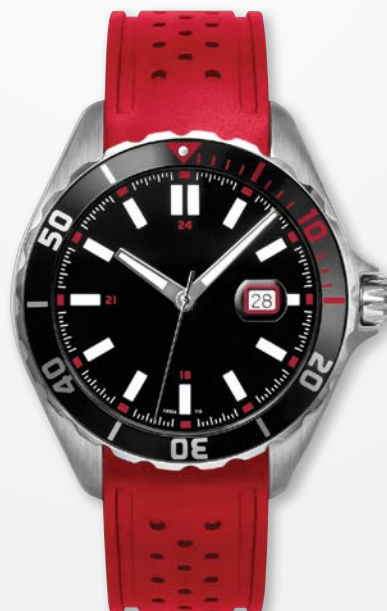
A9324W/RU-BLK/RED MSRP: $315