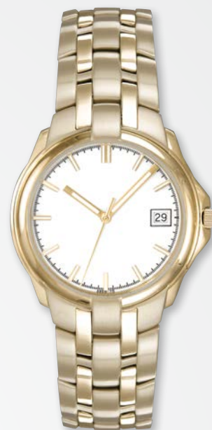
A9516Y-WHT MSRP: $360