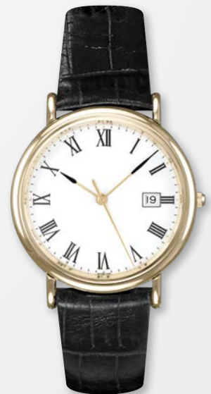
A4152Y/S-ROM MSRP: $240