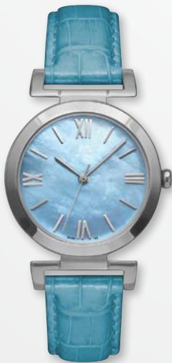
A4287W/S-MBLU MSRP: $225