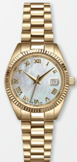
A4218Y/B-LIT MSRP: $450