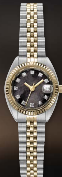
A4702-DRK MSRP: $540