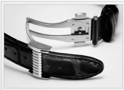
Dual push-button release deployment buckle on model A9824/S.

/S: Genuine leather strap, Dual push-button release deployment buckle