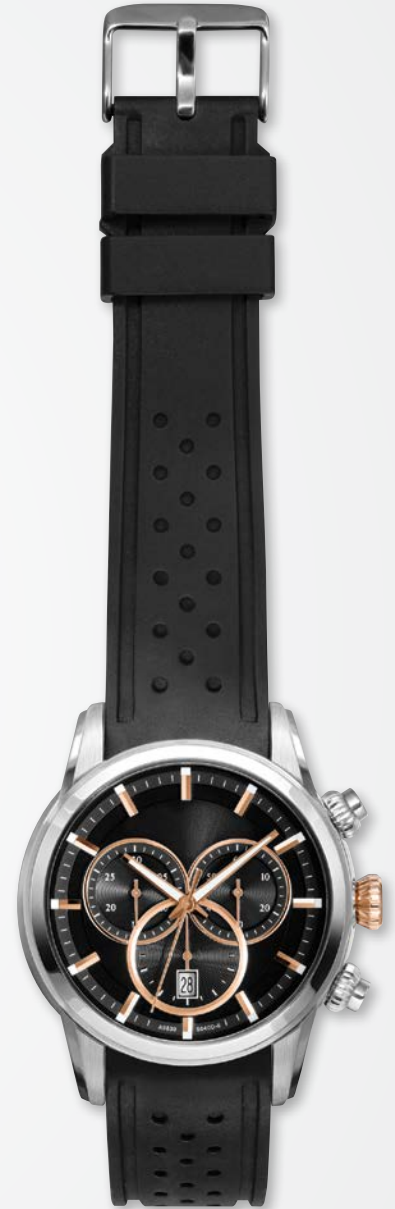
A9830TR/RU-BLK MSRP: $465