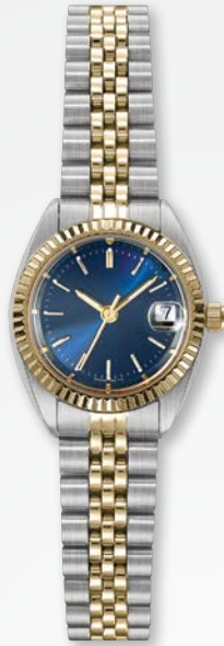
A4208T-BLU MSRP: $420