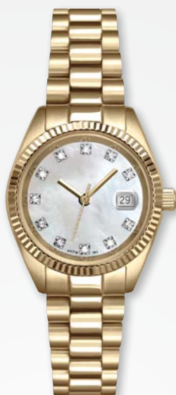
A4718Y/B-LIT MSRP: $555