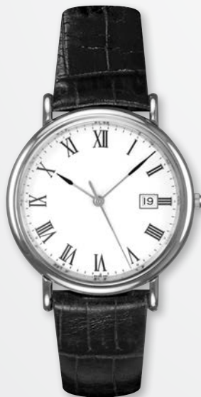
A4152W/S-ROM MSRP: $210