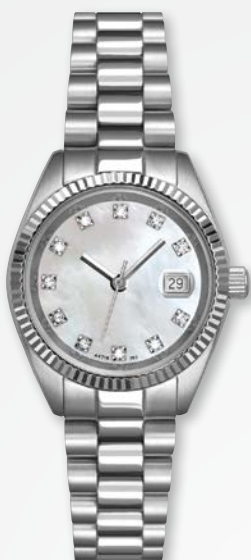
A4718W/B-LIT MSRP: $480