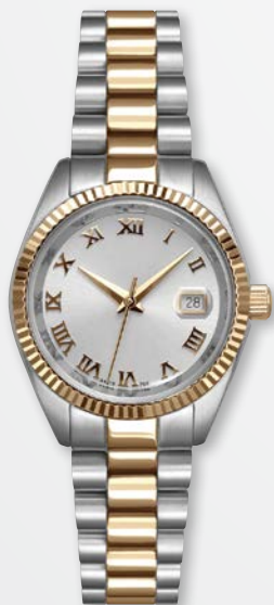
A4218T/B-SIL MSRP: $420