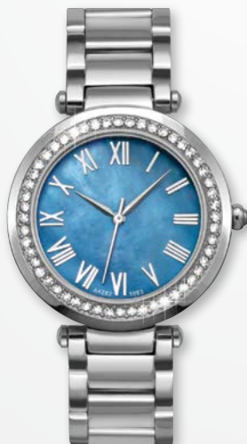
A4282W-BLU MSRP: $270