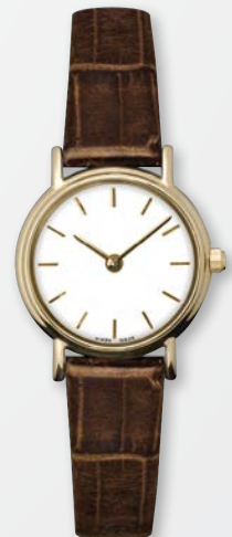
A1494-WHT/COG CALL FOR MSRP