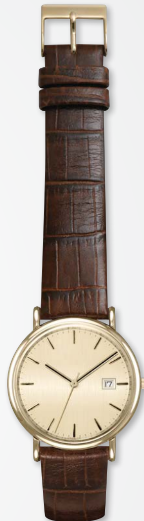
A4152Y/S-CHA MSRP: $240