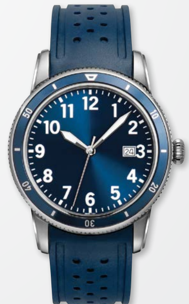
A8830W/RU-BLU MSRP: $330