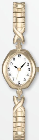
A171/62Y/X MSRP: $210