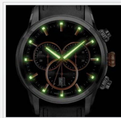
Swiss Super LumiNova highly luminous dial and hands on model A9830.