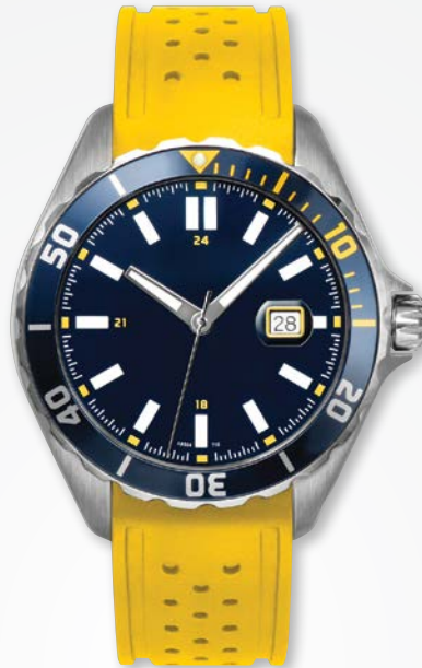
A9324W/RU-BLU/YEL MSRP: $315