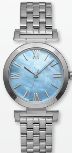
A4287W/B-MBLU MSRP: $285