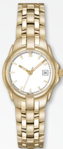
A9416Y-WHT MSRP: $360