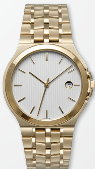
A4331Y-WHT MSRP: $375