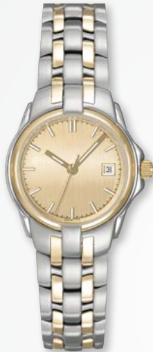
A9416T-CHA MSRP: $360