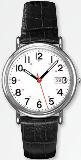
A4152W/S-FF MSRP: $210