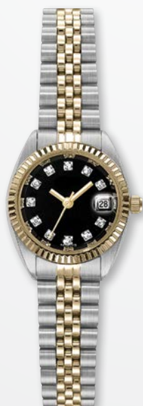
A4702-BLK MSRP: $510