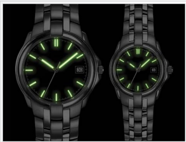
Swiss Super LumiNova highly luminous dial and hands on models A9416 and A9516.