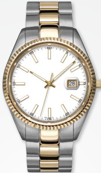
A4408T/B-WHT MSRP: $435