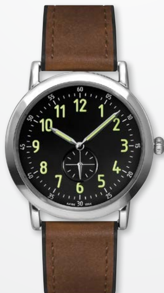
A4186W/NS-BLK/BRN MSRP: $270