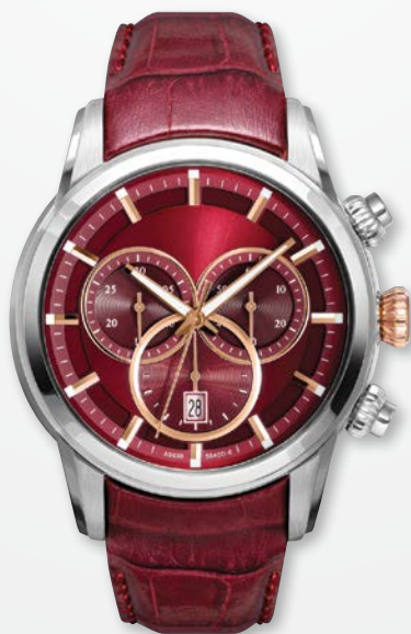
A9830TR/S-BUR MSRP: $525