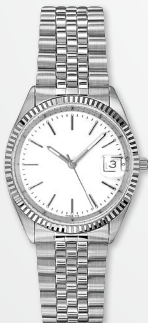
A4508W-WHT MSRP: $360