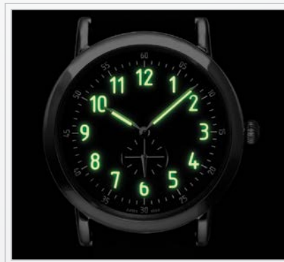
Swiss Super LumiNova highly luminous dial and hands on model A4186.