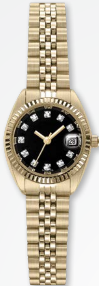
A4700-BLK MSRP: $510