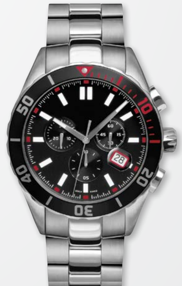
A9824W/B-BLK MSRP: $495