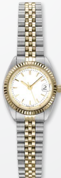
A4208T-WHT MSRP: $420