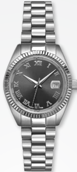
A4218W/B-GRE MSRP: $345