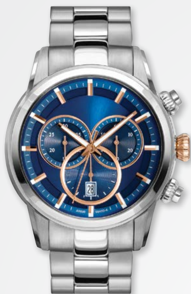
A9830TR/B-BLU MSRP: $510