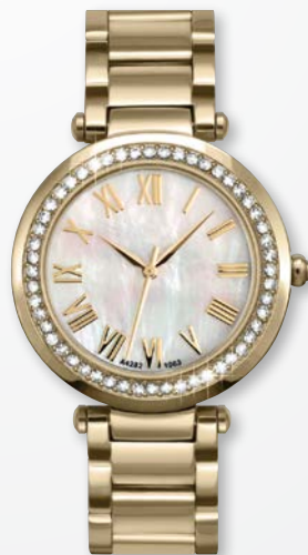
A4282Y-WHT MSRP: $345