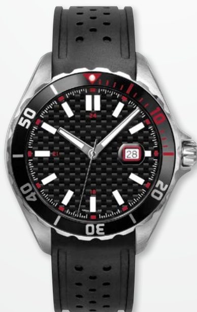
A9324W/RU-CAR MSRP: $345