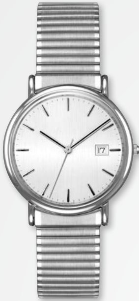
A4152W/X-WHT MSRP: $210