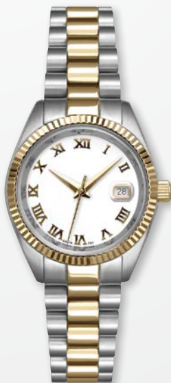
A4218T/B-WHT MSRP: $420