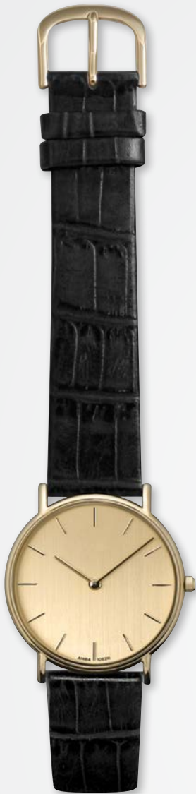
A1484-CHA/BLK CALL FOR MSRP