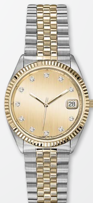
A4602-CHA MSRP: $510