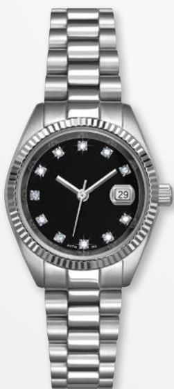
A4718W/B-BLK MSRP: $450