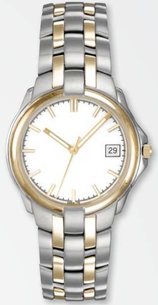
A9516T-WHT MSRP: $360