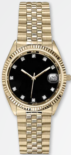
A4600-BLK MSRP: $510