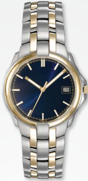
A9516T-BLU MSRP: $360