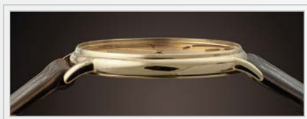
Side view of model A1484.