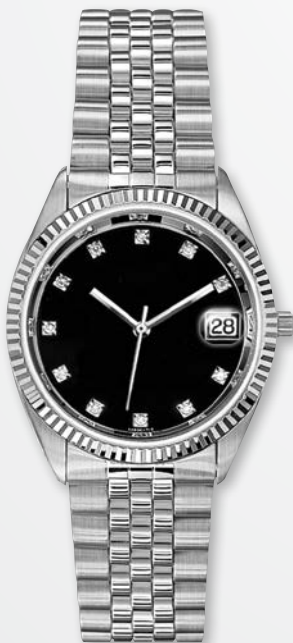
A4600W-BLK MSRP: $435