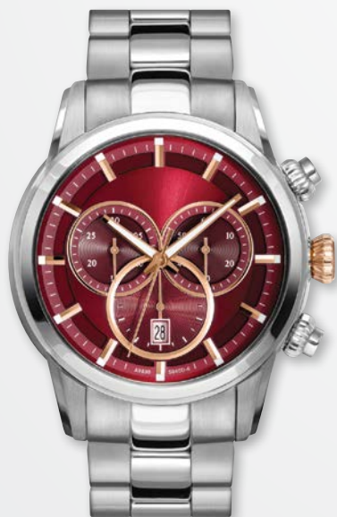
A9830TR/B-BUR MSRP: $510