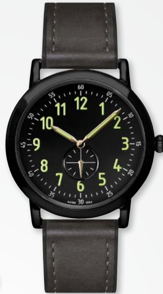
A4186BK/NS-BLK MSRP: $300