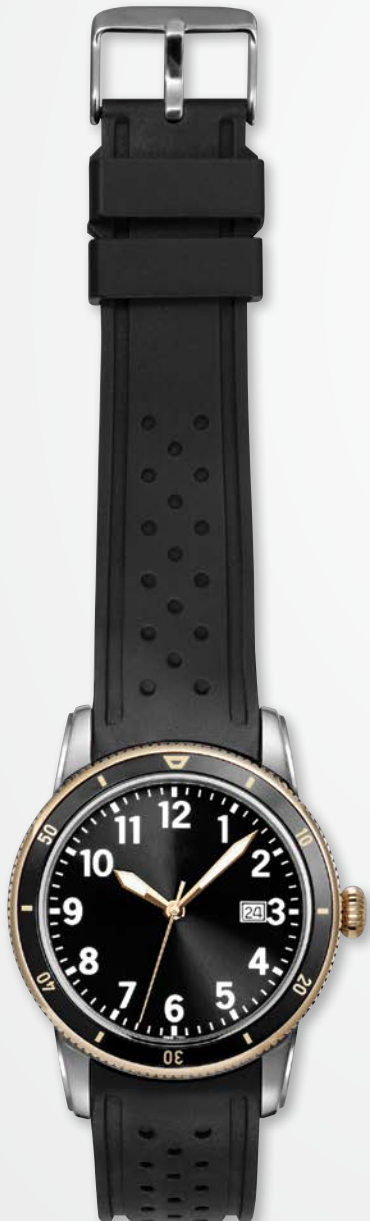
A8830T/RU-BLK MSRP: $360