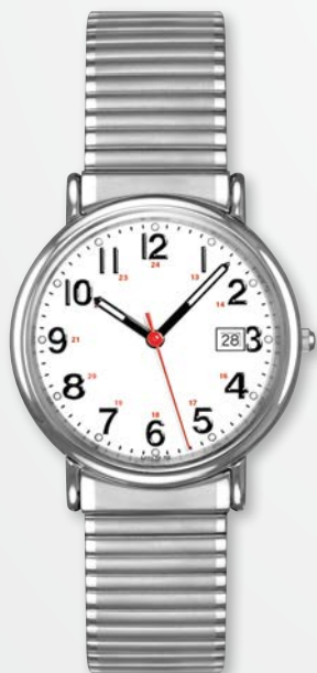
A4152W/X-FF MSRP: $210