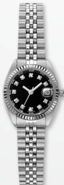
A4700W-BLK MSRP: $435