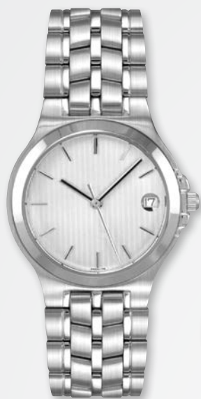
A4330W-WHT MSRP: $270