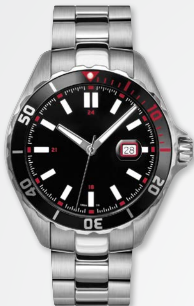
A9324W/B-BLK MSRP: $360