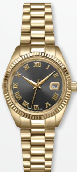
A4218Y/B-GRE MSRP: $420