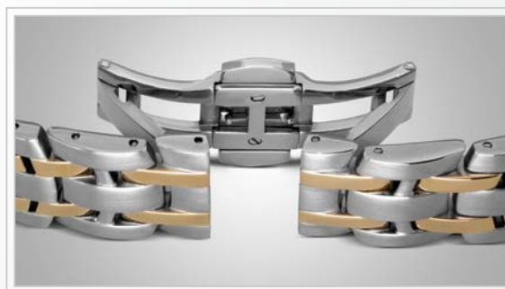
Bi-fold push-button deployment buckle models on A9416 and A9516.