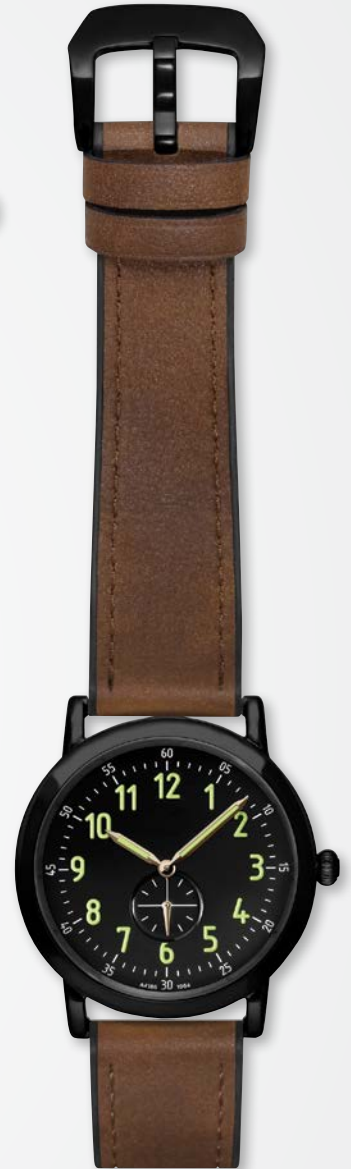
A4186BK/NS-BLK/BRN MSRP: $300