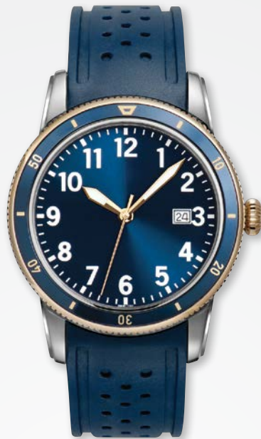
A8830T/RU-BLU MSRP: $360