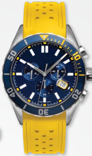
A9824W/RU-BLU/YEL MSRP: $435