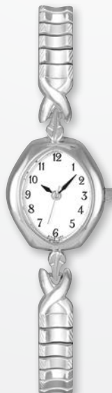
A171/62W/X MSRP: $150