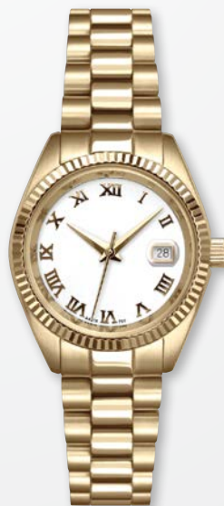
A4218Y/B-WHT MSRP: $420