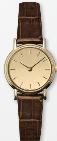
A1494-CHA/COG CALL FOR MSRP