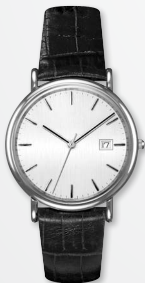
A4152W/S-WHT MSRP: $210