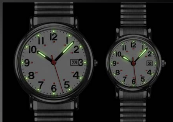
Swiss Super LumiNova highly luminous dial and hands on models A4152 and A4252.