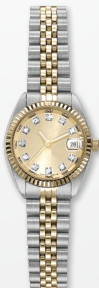
A4702-CHA MSRP: $510