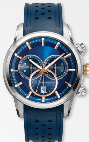
A9830TR/RU-BLU MSRP: $465