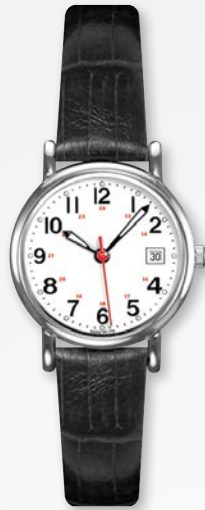
A4252W/S-FF MSRP: $210