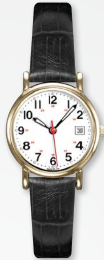
A4252Y/S-FF MSRP: $240