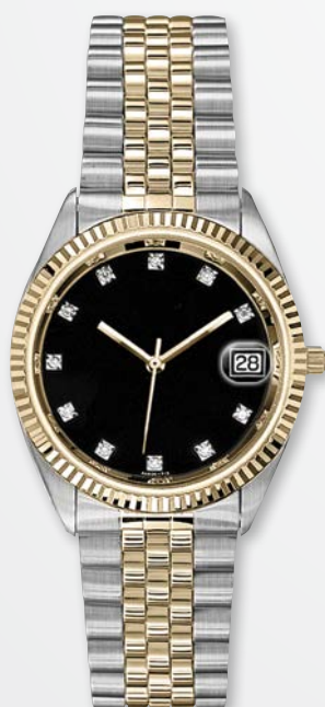
A4602-BLK MSRP: $510