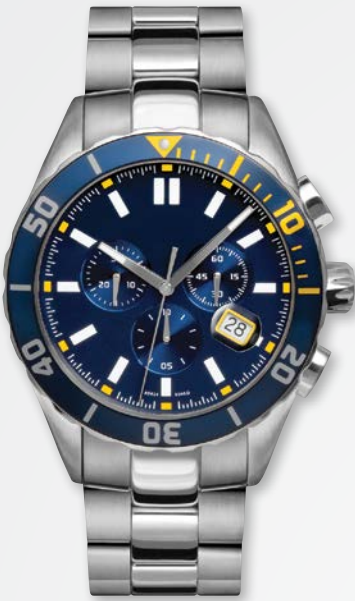
A9824W/B-BLU MSRP: $495