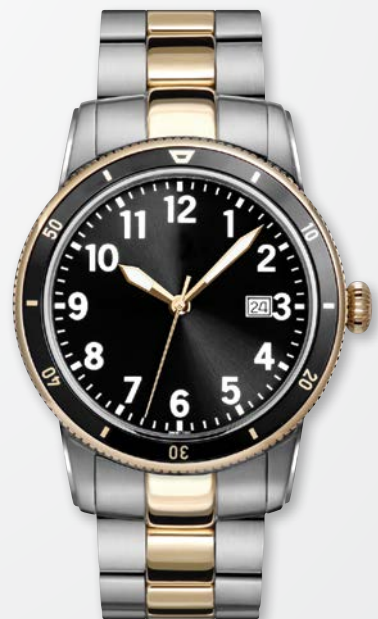
A8830T/TB-BLK MSRP: $450