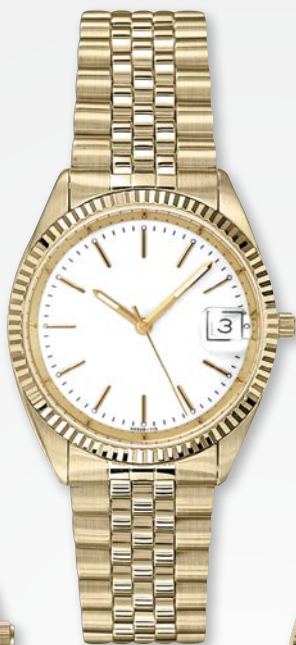
A4508Y-WHT MSRP: $420