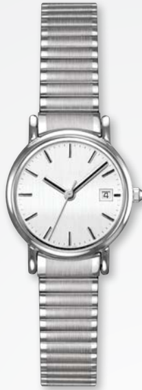
A4252W/X-WHT MSRP: $210