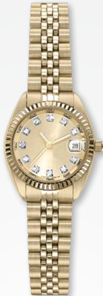
A4700-CHA MSRP: $510