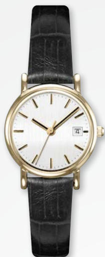
A4252Y/S-WHT MSRP: $240