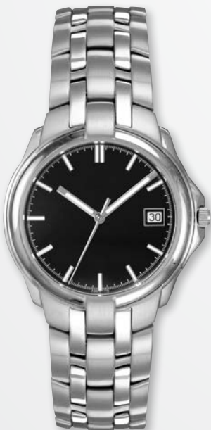
A9516W-BLK MSRP: $255