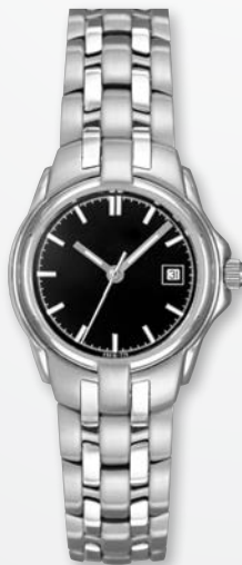
A9416W-BLK MSRP: $255