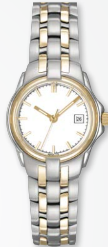
A9416T-WHT MSRP: $360