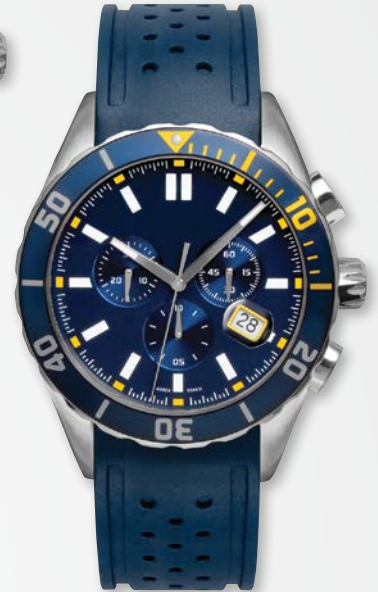
A9824W/RU-BLU/BLU MSRP: $435