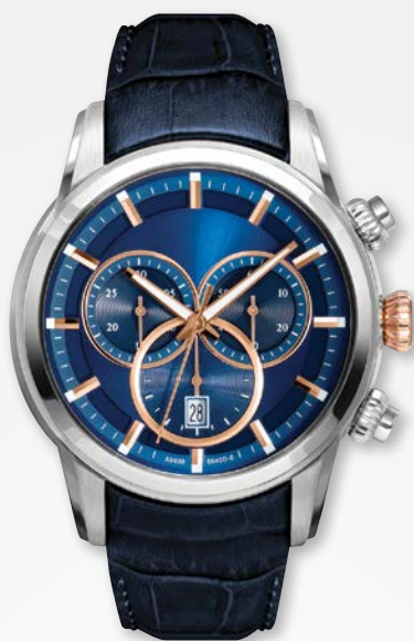
A9830TR/S-BLU MSRP: $525