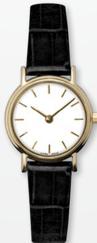
A1494-WHT/BLK CALL FOR MSRP

Ladies, 14 Karat gold, 3 ATM, Genuine leather strap, Genuine sapphire crystal, Case diameter: 23.5 mm