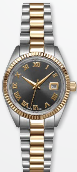
A4218T/B-GRE MSRP: $420