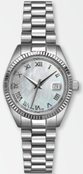
A4218W/B-LIT MSRP: $375