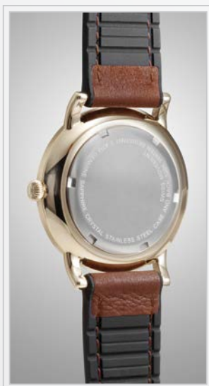
Soft leather inlaid rubber strap on model A4186.