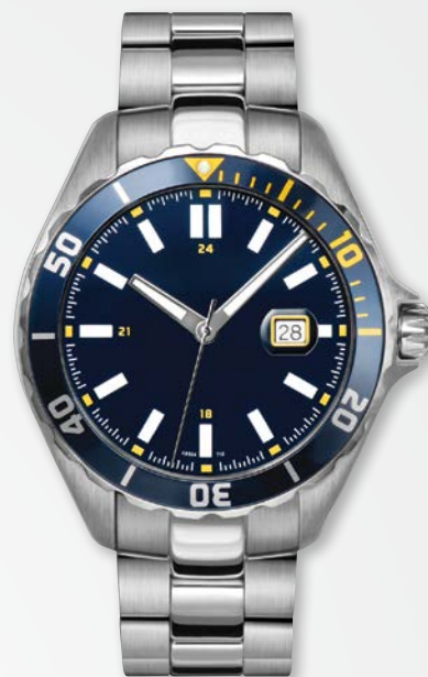
A9324W/B-BLU MSRP: $360