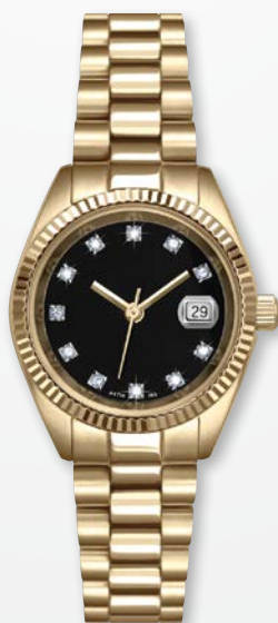
A4718Y/B-BLK MSRP: $525