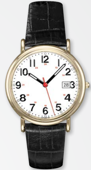
A4152Y/S-FF MSRP: $240