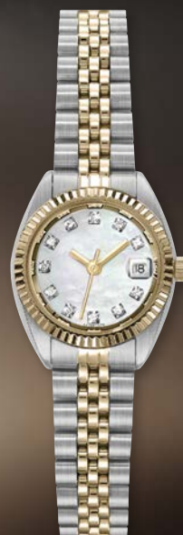
A4702-LIT MSRP: $540