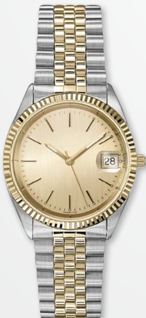
A4508T-CHA MSRP: $420

Gents, 10 ATM, Stainless steel case, Stainless steel bracelet, Diver security lock buckle, Genuine sapphire crystal with lens, Luminous dial and hands, Case diameter: 35.5 mm