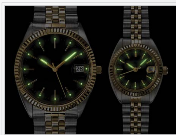
Swiss Super LumiNova highly luminous dial and hands on models A4208 and A4508.