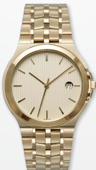
A4331Y-CHA MSRP: $375