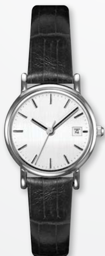
A4252W/S-WHT MSRP: $210