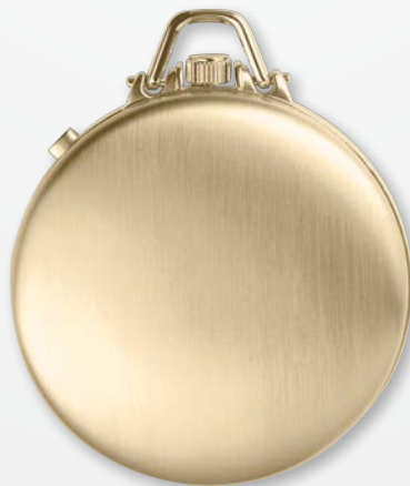
A1615Y MSRP: $630