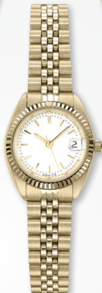
A4208Y-WHT MSRP: $420