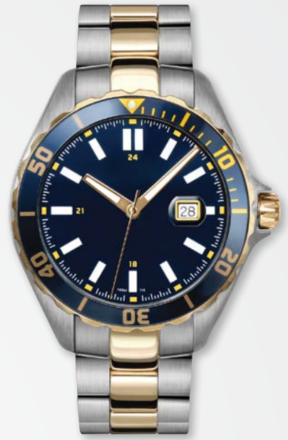
A9324T/B-BLU MSRP: $450