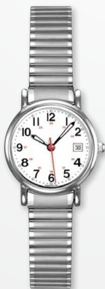
A4252W/X-FF MSRP: $210