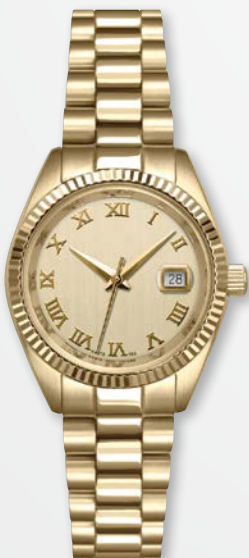
A4218Y/B-CHA MSRP: $420

Ladies, 10 ATM, Stainless steel case, Stainless steel bracelet, Diver security lock buckle, Screw down crown, Genuine sapphire crystal with lens, Genuine mother-of-pearl dial on LIT models, Case diameter: 29.8 mm