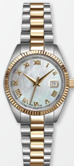
A4218T/B-LIT MSRP: $450