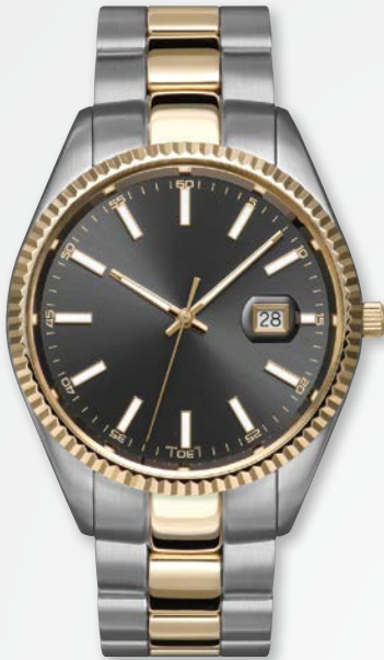
A4408T/B-GRY MSRP: $435