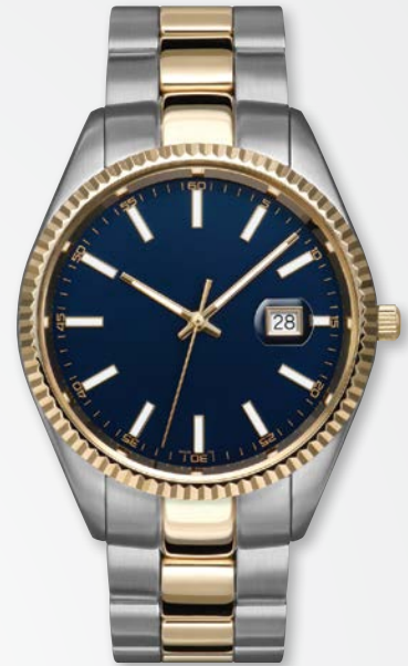
A4408T/B-BLU MSRP: $435