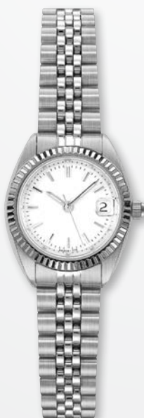
A4208W-WHT MSRP: $360