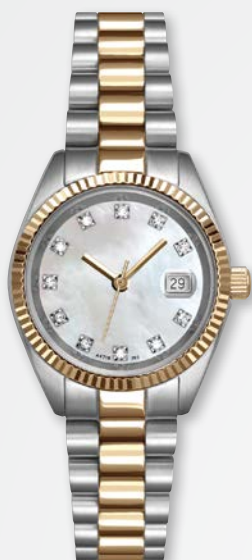
A4718T/B-LIT MSRP: $555