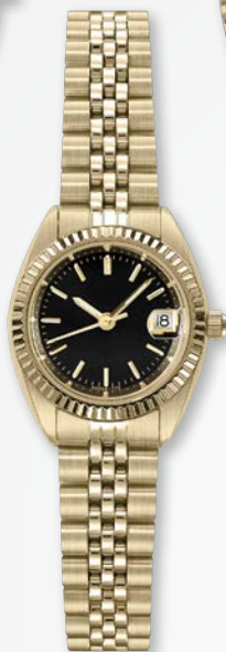
A4208Y-BLK MSRP: $420